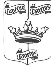
Arms of All Saints